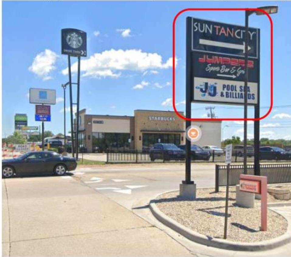
Freestanding signs along Plaza 20 frontage with Dodge Street, Street View July 2022 imagery